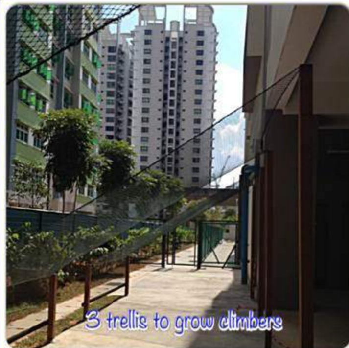
3 trellis to grow climbers