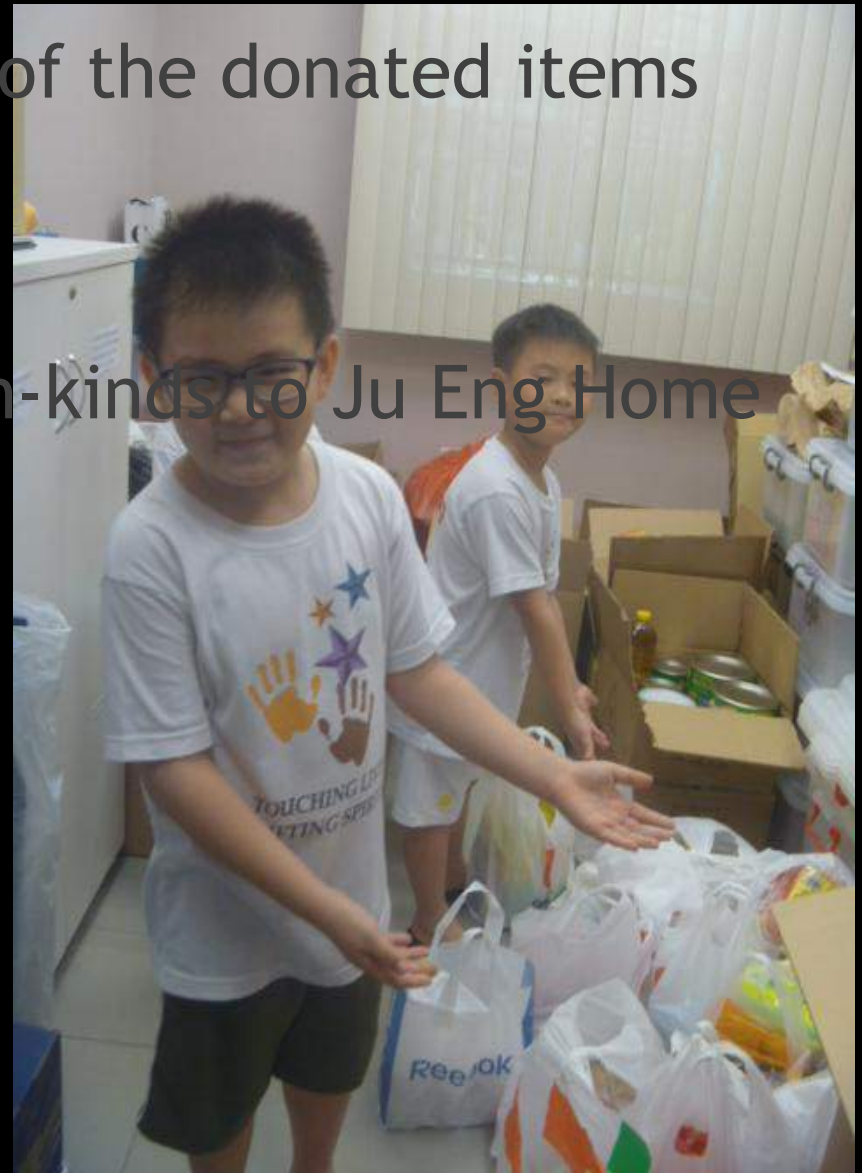
Food Donation Drive - Ju Eng Home - 29 May 2014