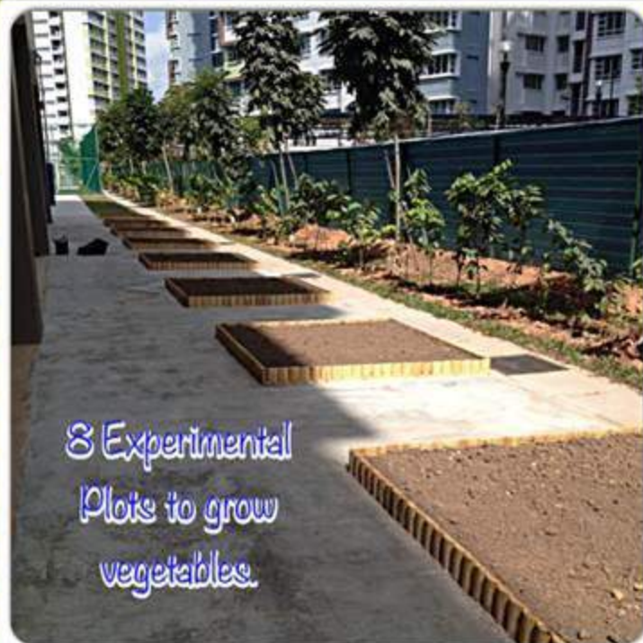
8 Experimental Plots to grow vegetables.