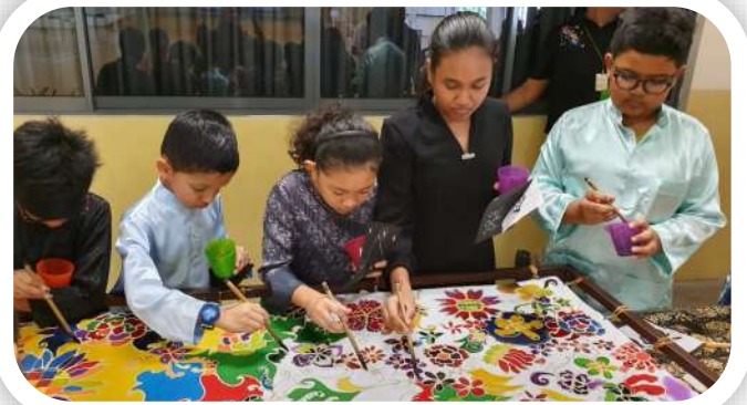
Students trying out batik painting during recess