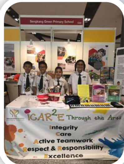
Our student ambassadors are ready to share