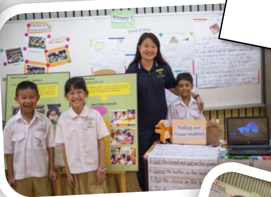
Our teachers and student ambassadors manning the Lower Primary English Language booth

A P1 student sharing how he learns in the classroom with members of the School Advisory Committee