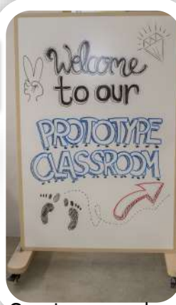
Opening up our lower primary prototype classroom