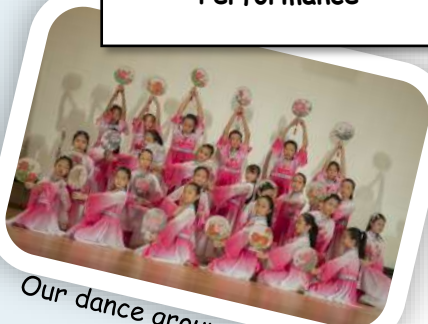
Our dance group showcasing their talent