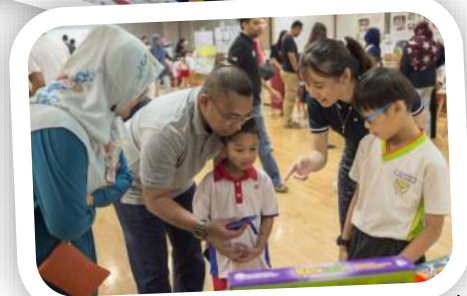
Teacher and student ambassador sharing on SKG curriculum with the parents