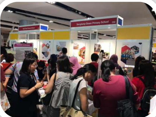
Sharing our programme with the visitors

Our school was invited to showcase our Learning for Life Programme, ICAR 2 E through the Arts, a structured whole school initiative that harnesses the benefits of arts education to inculcate the school values of Integrity, Care, Active Teamwork, Respect, Responsibility and Excellence (ICAR 2 E) in the students. It was indeed heartening to hear the encouraging and positive comments from fellow educators and partners during the MOE Excel Fest. Visitors were eager to find out more about this programme and its impact on the students' character development. Visitors were impressed with how the school has designed the arts programme such that values education are infused progressively to support the holistic development of our students.