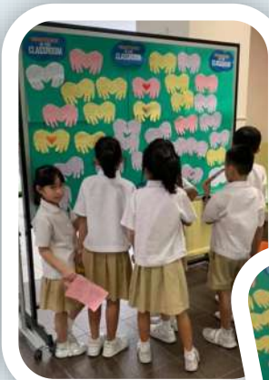
Students reading responses from others during recess.

During the June holiday, I helped my mother wash the dishes as she was busy with household chores.