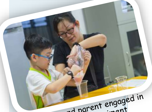
Student and parent engaged in a science experiment