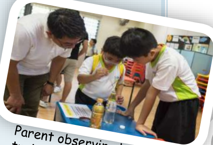
Parent observing his child trying to make a lava lamp