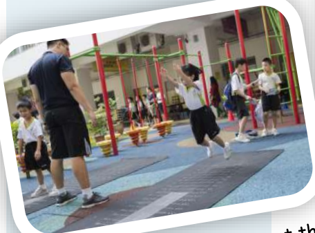
Students trying Broad Jump at the playground