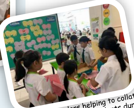
Student leaders helping to collate the responses from students during recess.