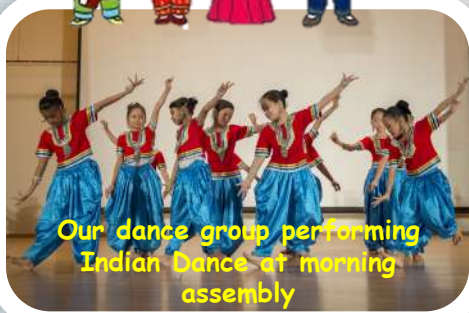
Our dance group performing Indian Dance at morning assembly

SKGians commemorated Racial Harmony Day (RHD) and celebrated Mother-Tongue Language (MTL) Fortnight on 19 July 2019. Both the events provided opportunity for students to learn about various ethnic cultures in Singapore and to be reminded of our shared experiences and values that have connected us as Singaporeans.