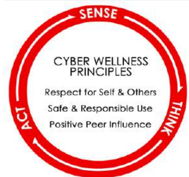
MOE Cyber Wellness Framework