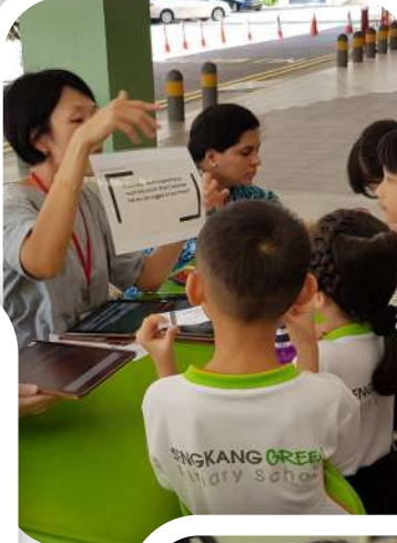
Our parent volunteers guiding our students about being safe in the cyberworld