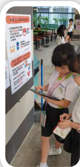
Learning about cyber wellness through various media