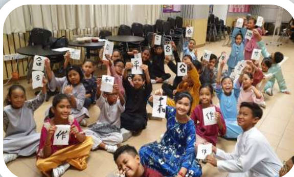
Students learning to write Chinese characters