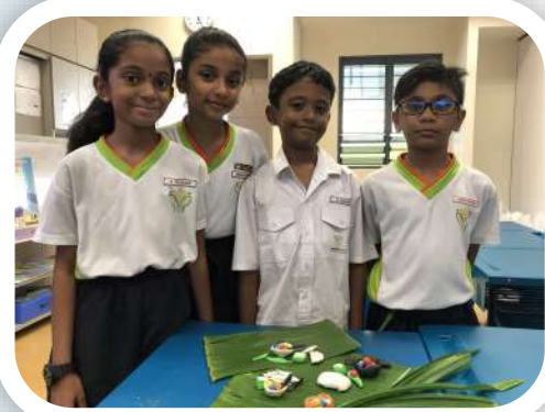
Students doing clay model of Traditional food

During the MTL Fortnight, students made paper dolls, tried on 4 traditional costumes, played traditional games and explored traditional art such as batik painting, calligraphy and kolam.