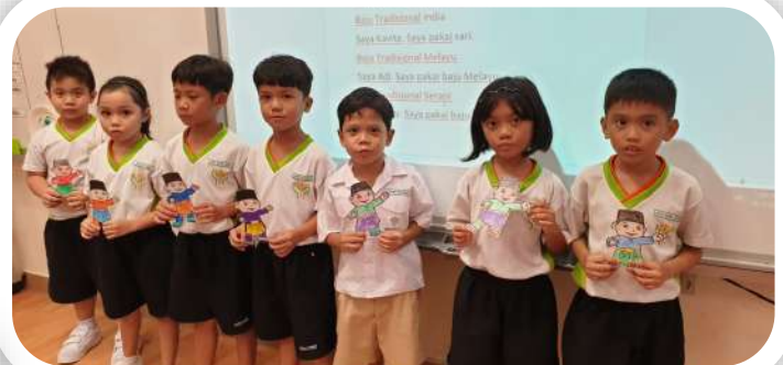
Making paper dolls in the classroom