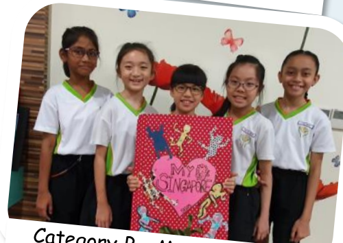
Category B - My Singapore (Certificate of Recognition)