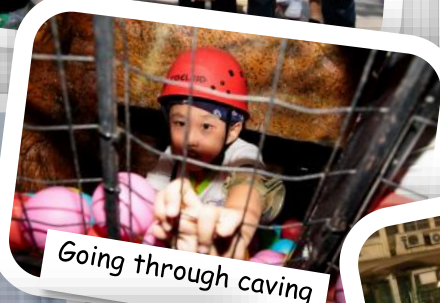
Going through caving