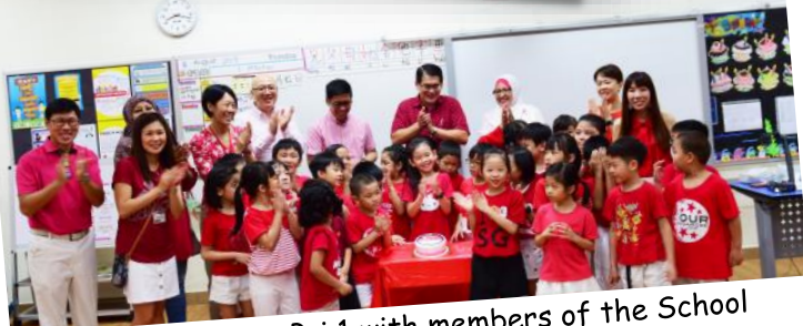
Cake-cutting in Pri 1 with members of the School Advisory Committee and the Parent Support Group