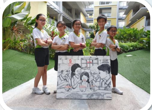
Category C - A Family On Separation Day (Certificate of Recognition)