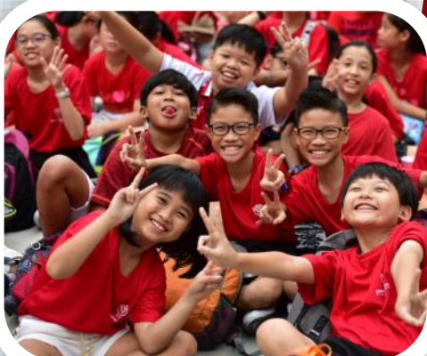
SKGians in red, ready for the celebration

During the Observance Ceremony, SKGians witnessed with pride the marching in of our Singapore flag and sang with gusto our National Anthem. For the first time, our march-past was led by 3 contingents formed by our Student Leaders, our Scouts Troupe and our CCA Leaders.