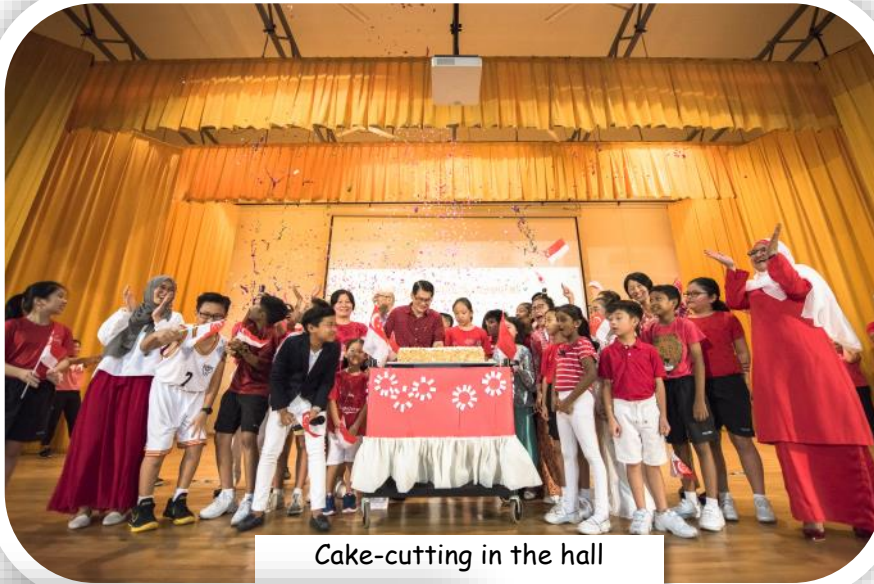
Cake-cutting in the hall

To mark our last 200 years of history, SKGians had a cake-cutting ceremony in the classrooms.