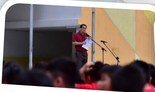
Mr Gau reading the National Day Message from Mr Ong Ye Kung, Minister of Education.