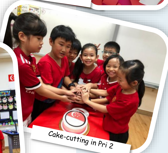
Cake-cutting in Pri 2