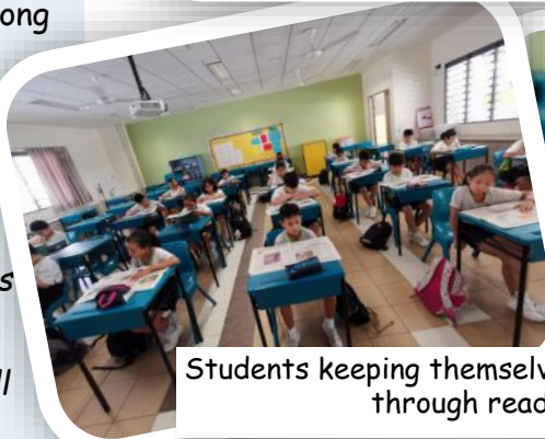
Students keeping themselves informed on local and global news through reading The Little Red Dot