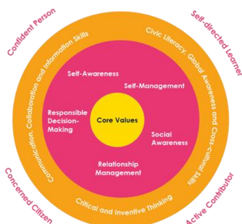
MOE's Framework for 21st Century Competencies and Student Outcomes

Through SEL, our students acquire skills, knowledge and dispositions to manage self and relationships effectively and make responsible decisions essential for personal and social well being. SEL is a critical part of our students' learning to prepare them to live and work as adults in this 21st Century. SEL is taught within the Character and Citizenship Education (CCE) curriculum in Sengkang Green.