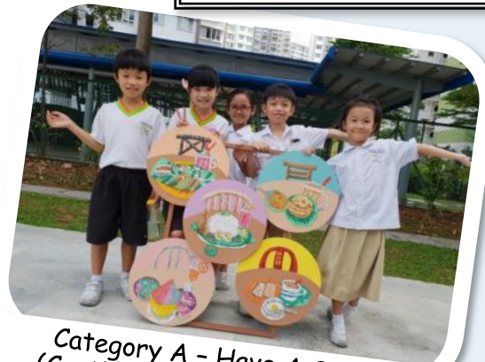
Category A - Have A Seat! (Certificate of Participation)