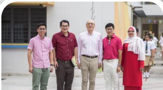
Members of the School Advisory Committee joining us for the National Day Celebration.