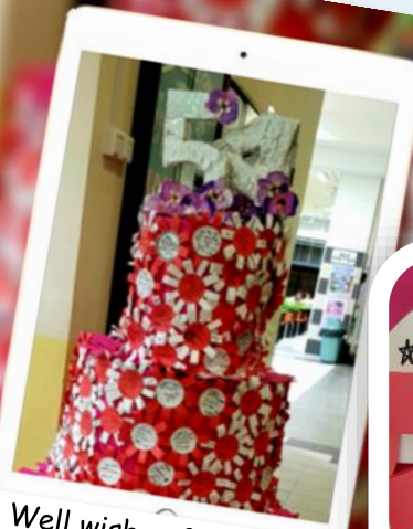
Well wishes from students