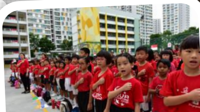
Students reciting The Pledge