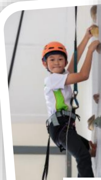
Confidence in completing obstacle challenge