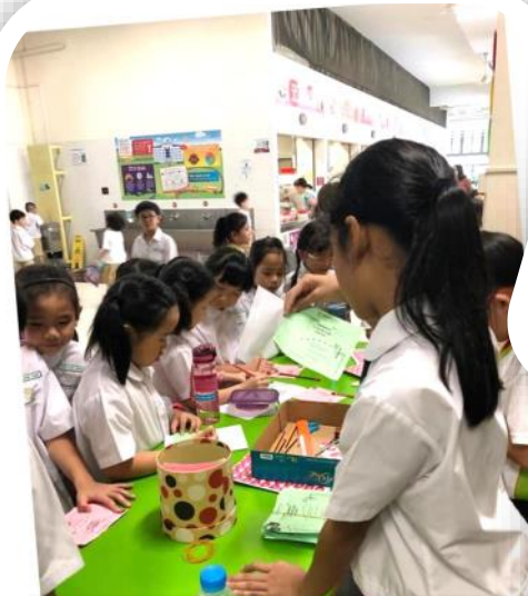
Students writing 'Thank you' notes to friends for being thoughtful.

It was very encouraging to see so many students come forward to share their experiences displaying thoughtful acts or being recipients of such acts. Students enjoyed the activities and saw the platform as a way to thank their friends who were thoughtful in their words and actions. The FOS leaders together with the student leaders did a good job in promoting and encouraging thoughtfulness in our students' daily lives. Well done!