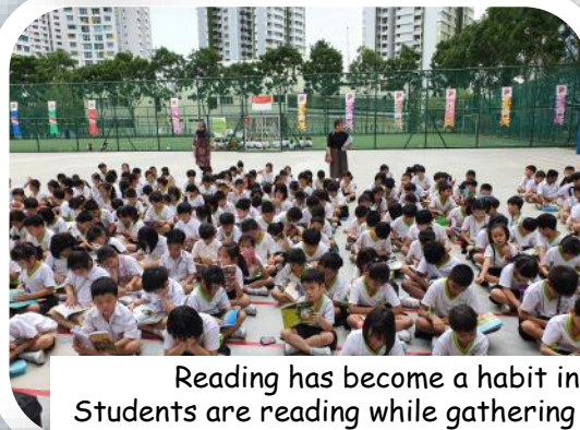
Reading has become a habit in SKG. Students are reading while gathering after recess