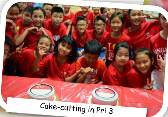
Cake-cutting in Pri 3