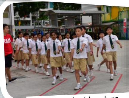
Our Student Leaders