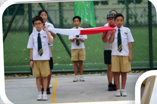
Our SKGian flag bearers